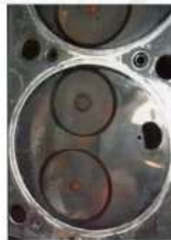
Valve Seating in a cab that is using the Pill. The difference is astonishing.