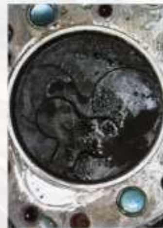
Valve Seating in a cab not using the Pill

"The Pill really does work - we have tested all kinds of devices which are designed to give better performance, but in our opinion, none have ever achieved results consistently as the Pill. The cleaning of the engine and fuel system starts immediately and within just a few tanks of fuel, you are driving a much cleaner vehicle, pumping out less emissions and saving money not only on fuel, but hefty servicing bills too. We believe engines using the Pill should last in excess of 600,000 miles."